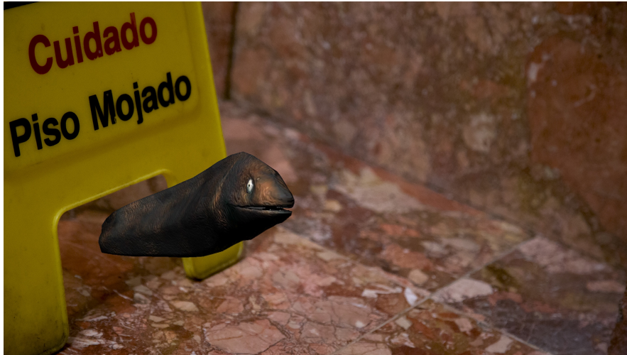
Satan plays his favorite trick , 2017, video still from single-channel HD video with sound, 6:00 minutes

Sara Stern's projects address the seams between digital and physical space – between the world and the computer screen; between shooting on location and shooting against an image of a location. Foundation Vent presents several pieces that address architectural sites and materials, animating them and ventriloquizing them. Stern works across video installation, performance, sculpture, photography, and writing, frequently incorporating humor, sets, illusions, and elements of classic continuity filmmaking.