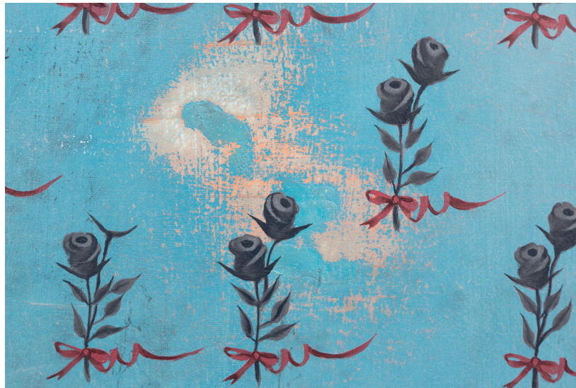
Untitled (detail), 2017, oil and acrylic on canvas, 48 x 48 inches

Bodies in time in relation to surface and value.