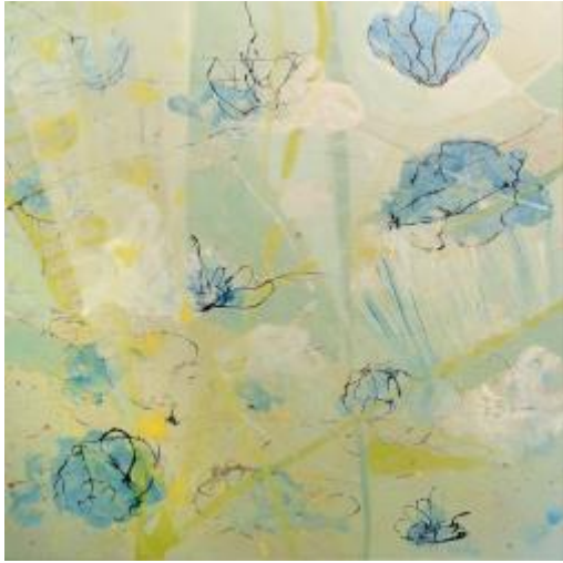
Mop Heads , 2016, acrylic on panel, 48 x 48 inches