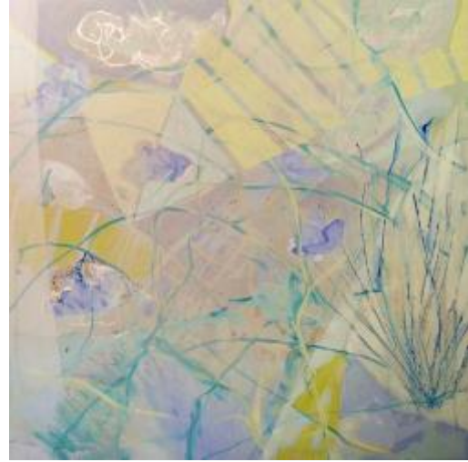
Lace Caps , 2016, acrylic on panel, 48 x 48 inches