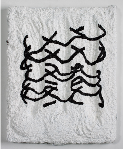
I thought I knew , 2014 Oil on rock, 20 x 16 x 2 inches