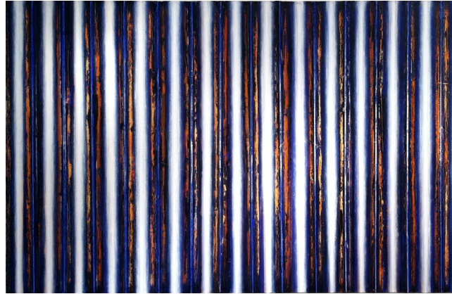
Aquarian Dreams , 2014 Oil and wax on canvas, 56 x 112 inches

Opening Reception for the Artist Friday, November 7 7 – 9 pm